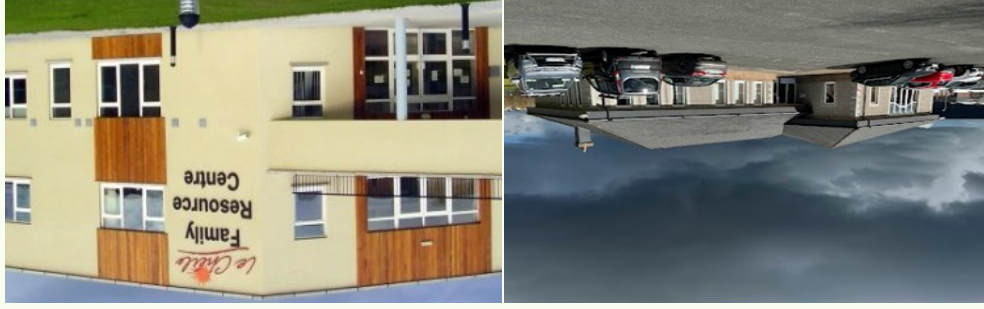
Le Chéile FRC and Mercy Centre Autumn News letter 2024